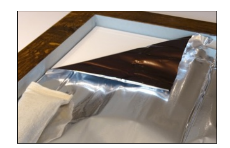
Finally, a pH neutral conservation quality backboard was used, secured using Framers Points and then sealed with brown gummed tape.

atmospheric pollutants, oxidising gases and moisture, a sheet of Reactive Interface Barrier System(RIBs) Foil was included between the mount package and the backboard.